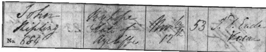
Burial Register (BT), Aycliffe, 1839