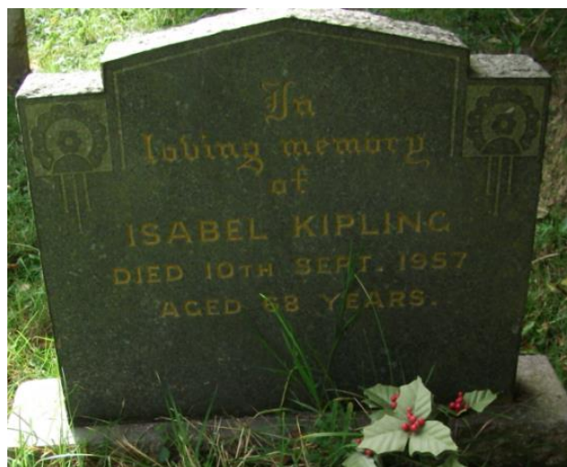
National Register 1939. Chapel St, Darlington

Kipling Isabel - 7 28 July 89 -W Widow domestic duties GREEN Marjorie - 7 2 Sept 15 S Book-keeper